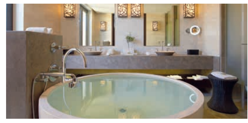
Long-term protection with Finalit