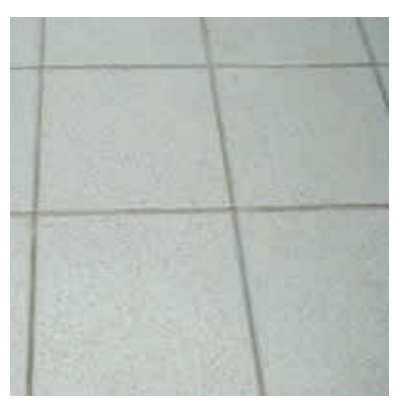
treated with Finalit products