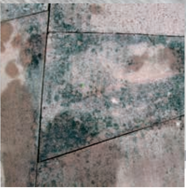
Red sandstone untreated