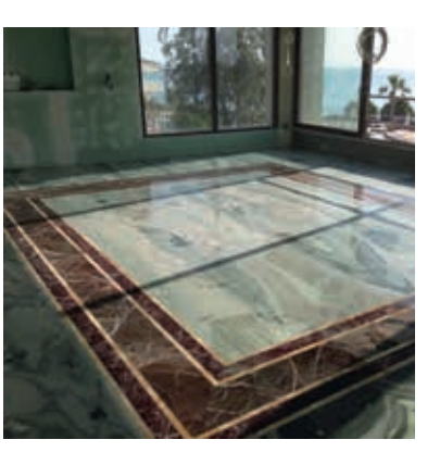
treated with Finalit products