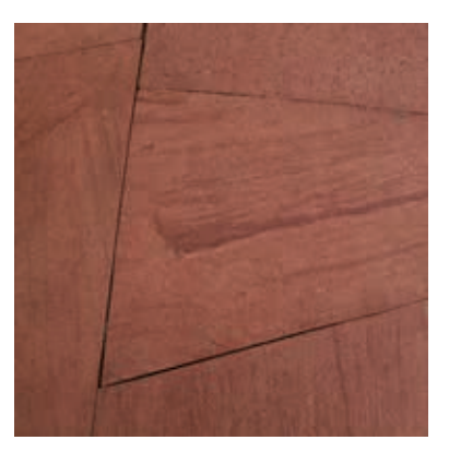
treated with Finalit products