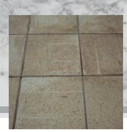
Ceramic tiles untreated