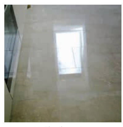
treated with Finalit products