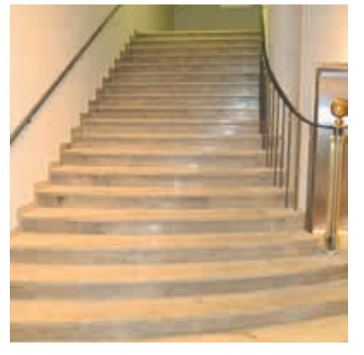
treated with Finalit products